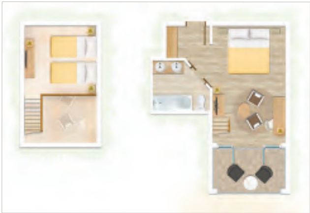
Family Duplex Garden / Family Duplex Sea facing