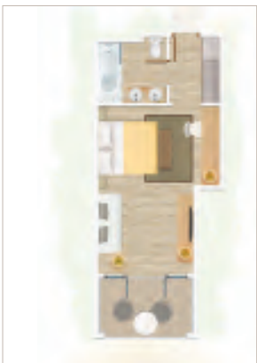
Superior Garden / Superior Sea facing