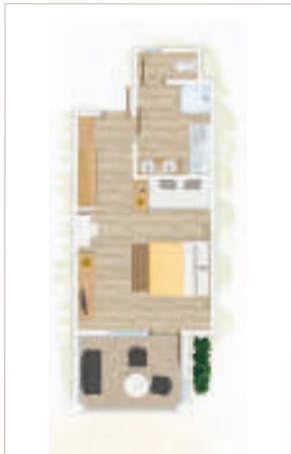
Deluxe Sea Facing Room