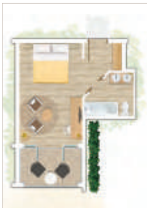
Standard Sea facing