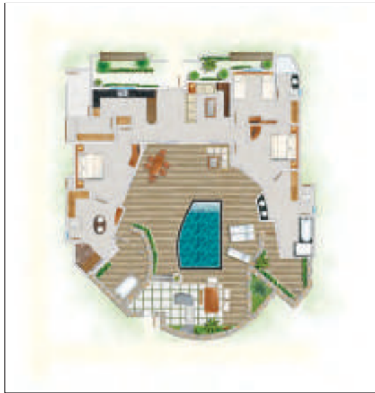
3-Bedroom Pool Villa