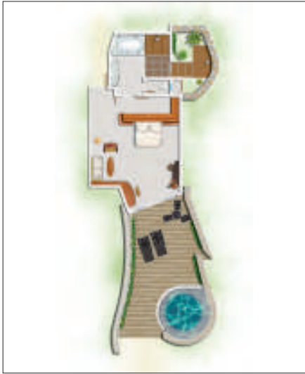
Beachfront Suite with pool