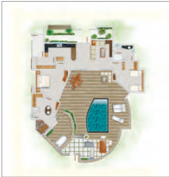
2-Bedroom Pool Villa