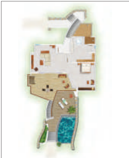
Beachfront Senior Suite with pool