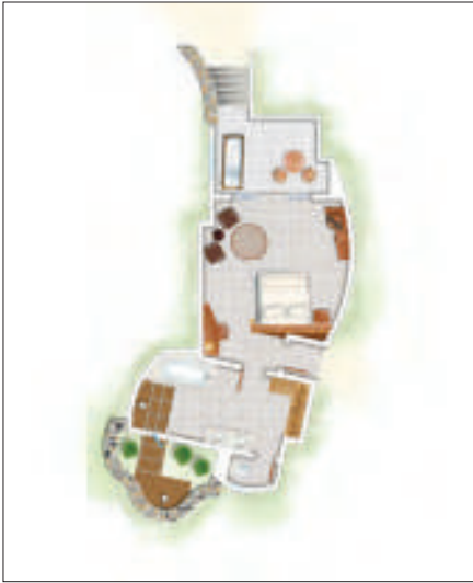
Tropical Junior Suite / Suite Golf